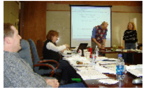
SPQA Examiners During Consensus Meeting